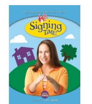
Signing Time! DVD Series 2, Volume 8—My House (2008)

Phone: 803-216-3206 Fax: 803-216-3223 steve.wilson@uscmed.sc.edu http://uscm.med.sc.edu/cdr