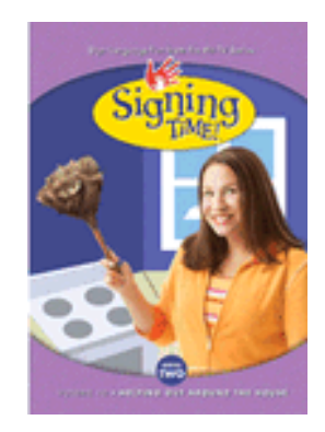
Signing Time! DVD Series 2, Volume 10—Helping Out Around the House (2008)

— "In Helping Out Around the House you'll discover that work feels like play as you sing and sign your way through household chores! Some of the signs included are: