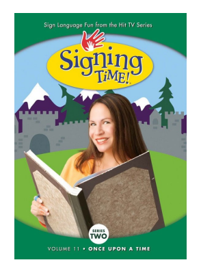
Signing Time! DVD Series 2, Volume I I—Once Upon a Time (2008)

Phone: 803-216-3206 Fax: 803-216-3223 steve.wilson@uscmed.sc.edu http://uscm.med.sc.edu/cdr